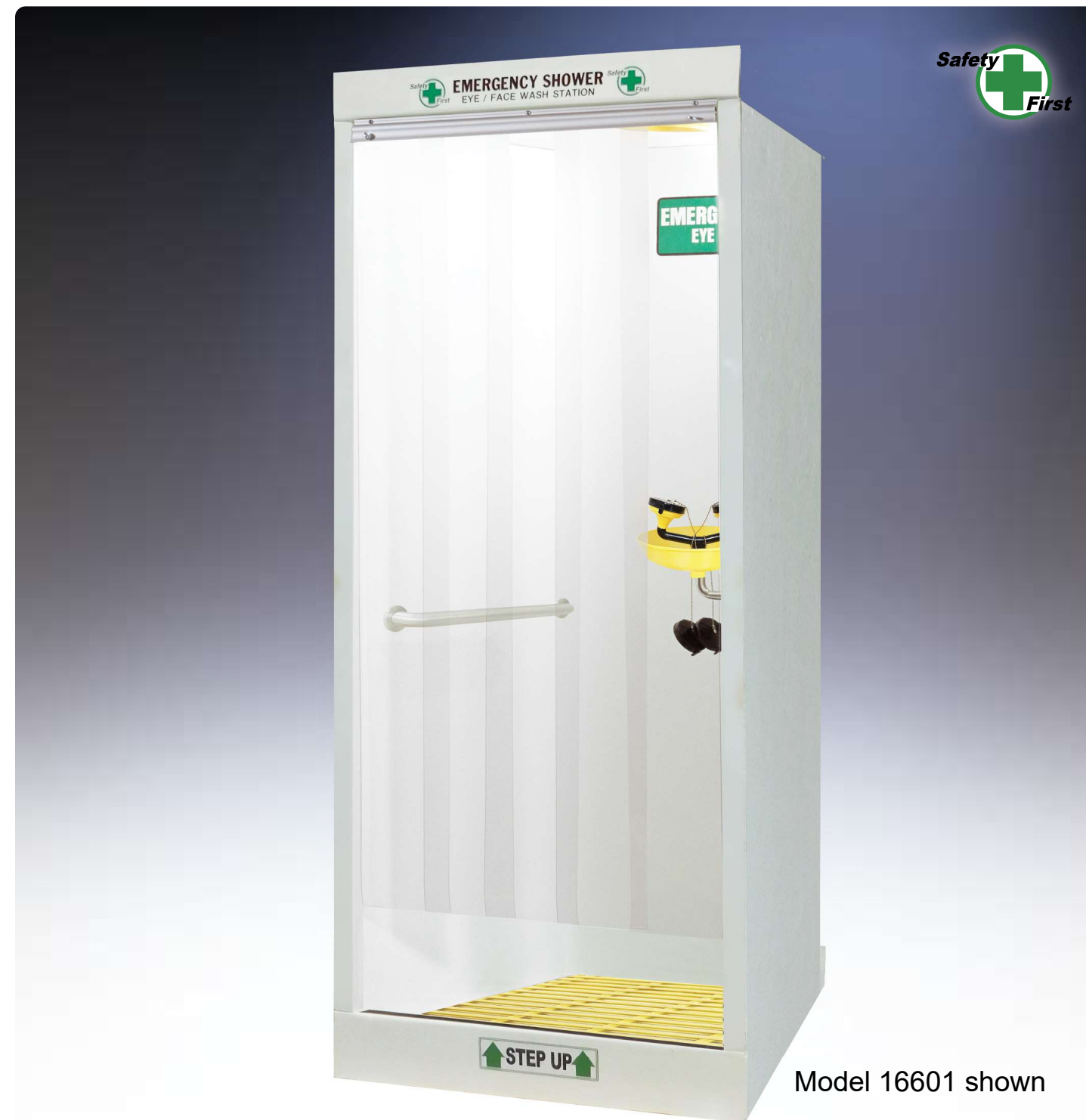
Model 16601 shown

For Industrial Applications Cat. No. 16601, For Laboratory Applications Cat. No. 16604